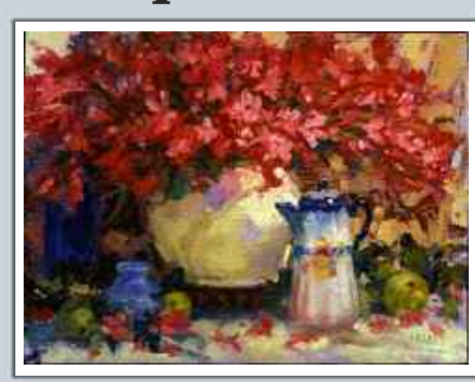
Florals, Still Life, Landscape, Figurative